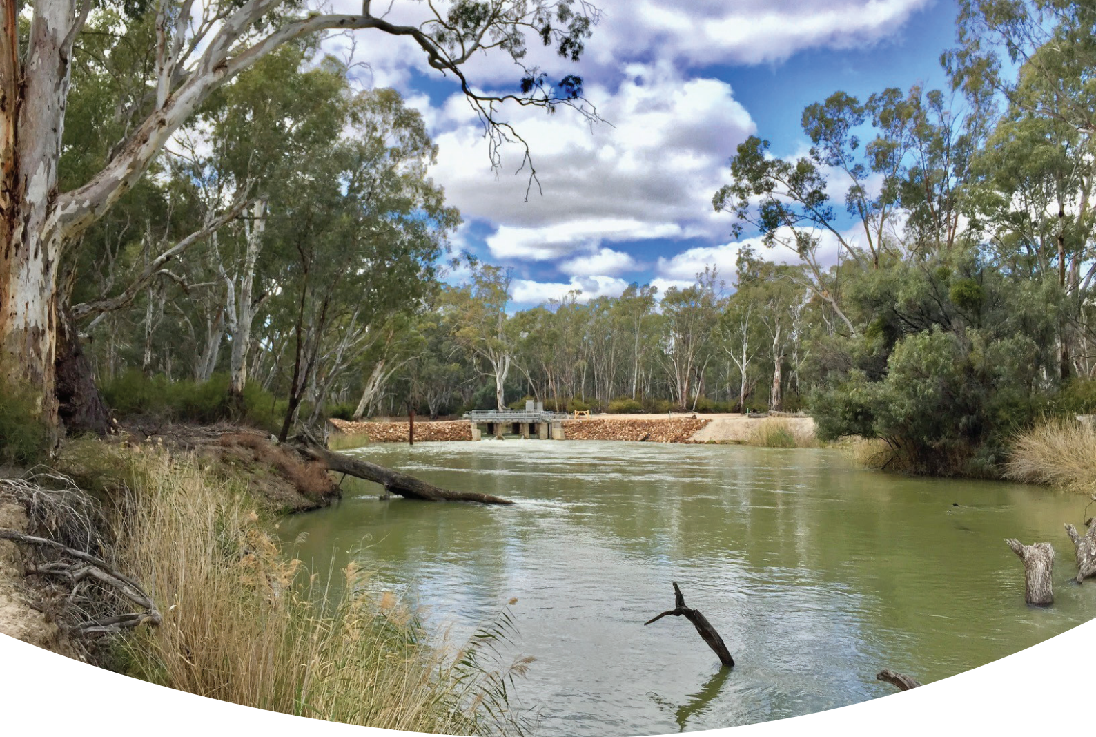
Photo: Lindsay Island on the River Murray, Victoria.

Both the MDBA and the CEWH make considerable volumes of information on river activities and environmental watering available. However, these functions are inherently technical and complex and can be difficult for a non-expert to digest. For example, there are over 20 websites for consumers to obtain information on river operations and water volumes. The inherent complexity in the system, together with inconsistencies in how information is collated and presented, can act as a barrier to reaching the community. It also makes it difficult for the majority of individuals to navigate. This is likely leading to a trust deficit from some stakeholders.